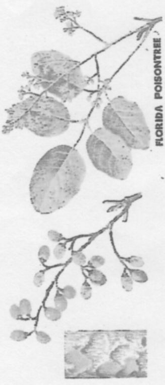
FLORIDA POISON TREE